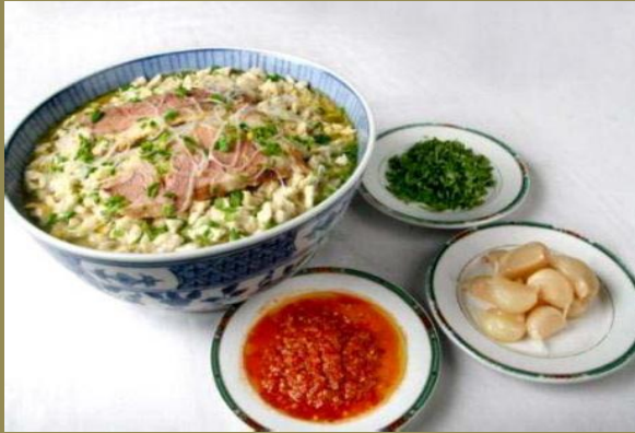
Crumbled Unleavened Bread in Mutton Stew