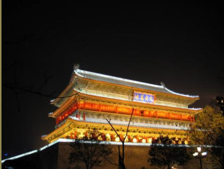
The Drum Tower