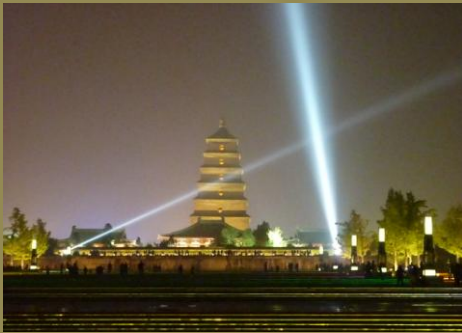
The Wild Goose Pagoda