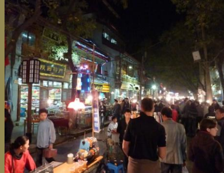
The Muslim Quarter