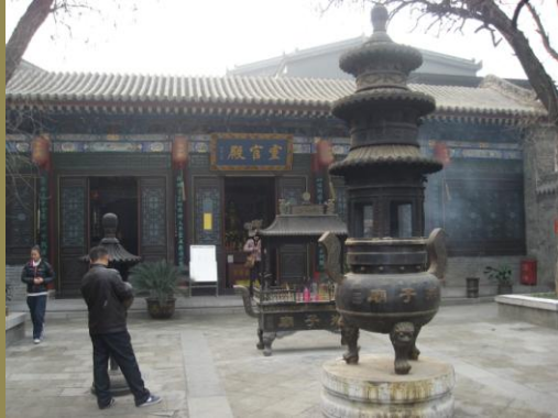
The Xiangzhimiao Taoist Temple