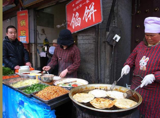
Pancake Stand in Muslim Street