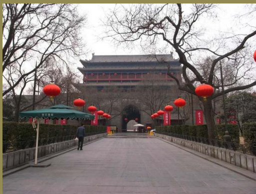
The South Gate of the City Wall